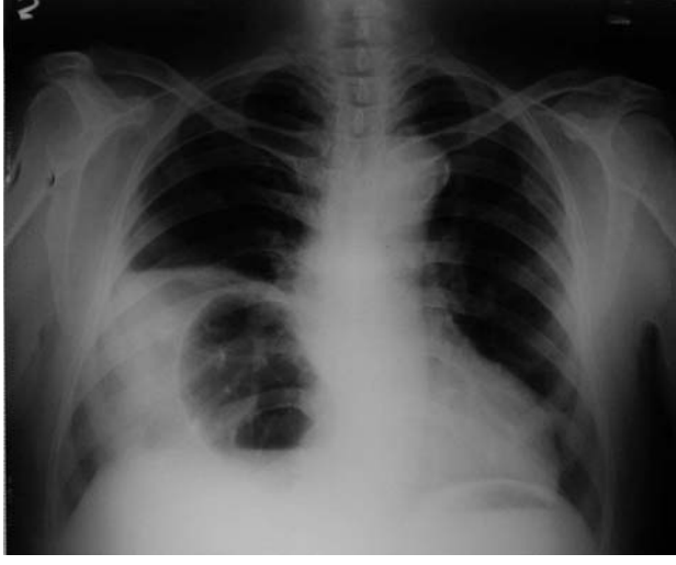
Figure 1. On the postero-anterior view, herniation of the gasfilled distal stomach at the first chest x-ray is seen.

The laboratory tests were normal except the white blood count, 14000/L. In chest X-ray examination, a right paracardiac air-containing soft tissue mass suggesting Morgagni hernia was observed (Figure 1). CT of the thorax showed a paracardiac hernia containing stomach and colonic segments (Figure 2).