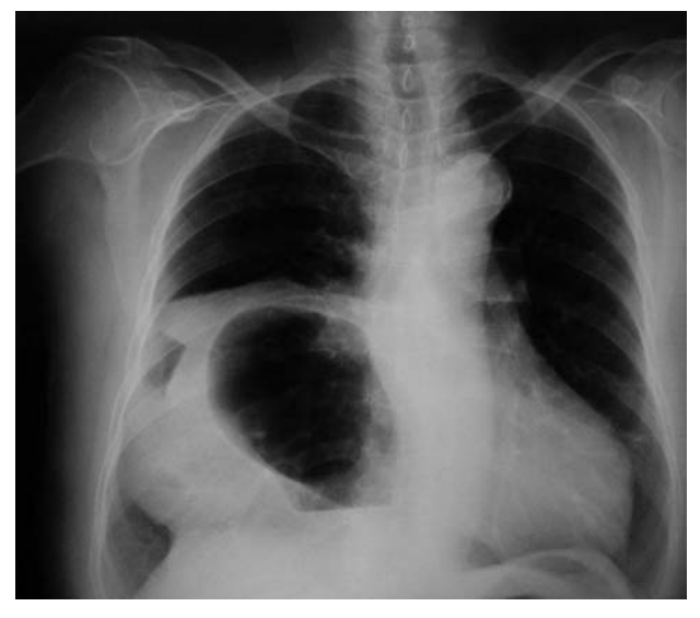
Figure 3. On the postero-anterior view , the hernia sac causing mediastinal shift to the left is seen at the second chest x-ray.

Nasogastric tube was placed and 2000 cc gastric content was drained. But patient's respiratory status was getting worse in three-hour-period in the emergency department. Second postero-anterior and lateral chest X-ray revealed mediastinal shift caused by the hernia sac which was increased approximately two times in size (figure 3,4).