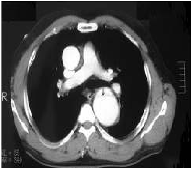
Figure 2a. This axial CT scan at the level of main pulmoner artery shows normal appearance of ascending aorta but in the other hand the widening of descending aorta with divided aortic lumen by an intimal flap.

The laboratory abnormalities returned to normal levels 7 days after admission (Table 1). The patient was clinically stabile as long as his hospitalization period. The patient was discharged from the hospital according to the consideration and suggestion of cardiovascular surgeons.