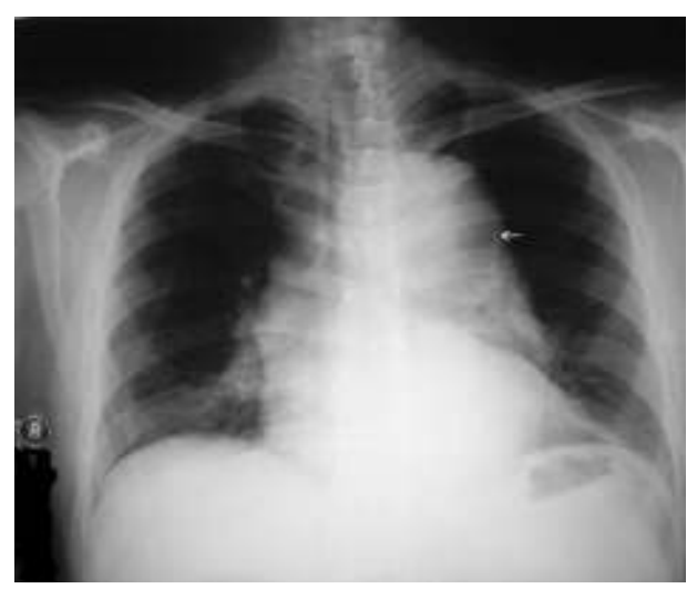
Figure 1. The chest roentgenogram of the patient shows the widening in mediastinum. In addition with the widening of descending aorta was seen.

Thoracic and abdominal computed tomography that was performed to rule out AD showed an intimal flap which was separated the aortic lumen into two parts which were extended from the proximal descending aorta to the truncus celiac and the superior mesenteric arteries (Figure 2A, 2B).