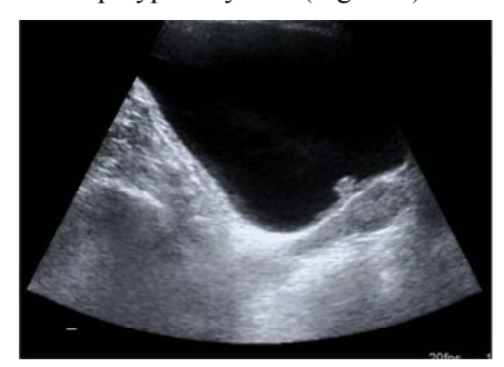
Figure 1. Transabdominal US image was shown a 7 mm solid homogeneous echoic mass protruding into the bladder lumen.

The abdominal ultrasound showed a 7 mm polypoid mass projecting into the bladder lumen (Figure 1). During cystoscopy, sessile, papillary lesion was seen on the trigon of bladder. Transurethral resection of the tumor was performed. The pathological diagnosis was polypoid cystitis (Figure 2).