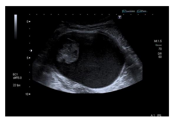
Figure 1. Ultrasound demonstrates a large cystic mass with echogenic debris and mural nodule measuring approximately 76x110 mm

and the mural nodule was heterogenous hypoechoic and there was no blood flow signal within the nodule in color Doppler evaluation (Figure 2).