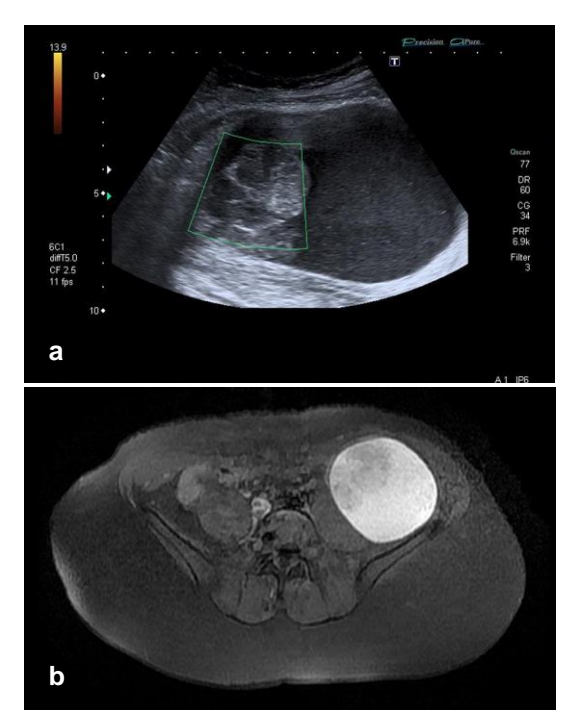
Figure 3. Transverse T2W MRI revealed the presence of a large cystic mass lying in front of the left psoas muscle. A mural nodule on the wall of cyst with heterogenous signal intensity is seen (a). Cyst content is hyperintense on T1W fat-supressed image (b).

Subsequent contrast enhanced abdominal magnetic resonance imaging (MRI) was performed to evaluate nature and extent of the mass. The MRI revealed an 11x8 cm cystic retroperitoneal mass (Figure 3) with a mural nodule. The mass was located in retroperitoneal space of left lower quadrant in front of the psoas muscle. The cyst was hyperintense in both fat-suppressed T1-weighted spin echo and T2-weighted fast spin echo images. The mural nodule (Figure 4) measured approximately 5x5 cm and showed minimal enhancement in the contrast-enhanced T1-weighted fat-suppressed images. There was no enhancement in the thin wall of cyst. The surrounding organs were displaced by the mass however there was no evidence of invasion. Both ovaries and uterus were normal (Figure 5). There was no distant metastasis seen on abdominal MRI.