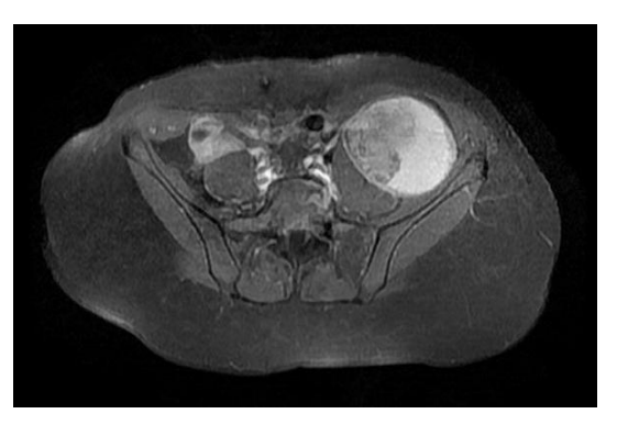
Figure 4. Transverse gadolinium-enhanced fat-supressed T1-weighted MR image demonstrates mild enhancement of mural nodule with no evidence of invasion.