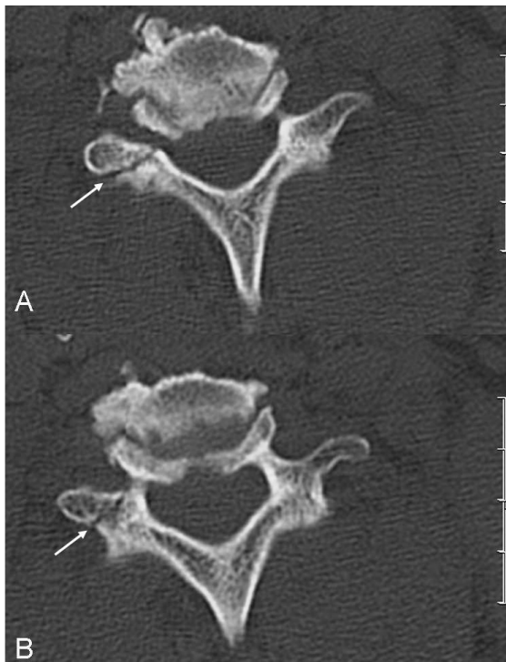
Figure 1. A-B: Cervical axial CT showed right C6-7 facet and C7 lamina fractures.