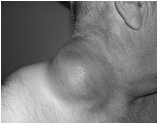
Figure 1. Preoperative view of mass.

cystic mass with thickened walls, and 85 x 55 mm dimensions. Computed tomography (CT) of the neck showed a simple cystic mass with dimensions of 6x4.5x9 cm in the right side of the posterior cervical region (Figure 2). Therefore, we performed fine-needle aspiration biopsy (FNAB) of the mass. When FNAB was performed, a crystal-clear liquid was drained. Elevated antibody (Echinococcus granulosus-IgG positive: 1/100) was detected in cytology of the drained fluid aspiration of the cyst. Therefore the diagnosis of hydatid cyst was strongly suspected.