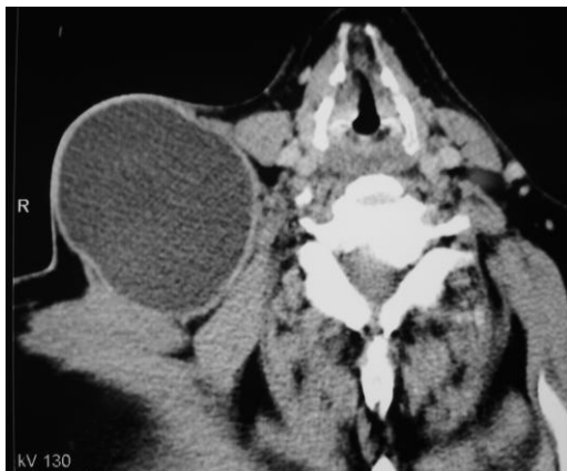
Figure 2. Axial computed tomography (CT) scan shows a welldefined, rounded, cystic mass.