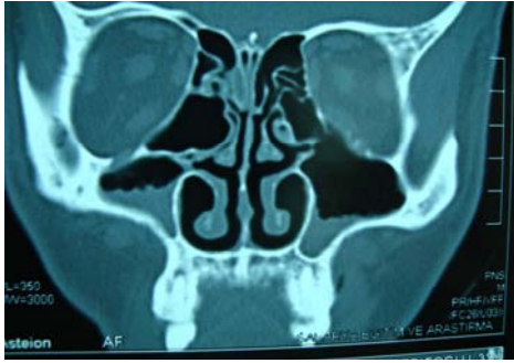
Figure 1b. Control CT taken 2 years after the surgery reveals no mucocele.