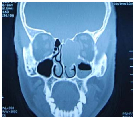
Figure 2. The lobulated mass approximately filled the right nasal cavity, destroying the bone structures and compressing the medial rectus muscle was seen in a coronal paranasal sinus CT.

A 50 years old male was referred to our outpatient clinic from an ophthalmology clinic. He was suffering from epiphora and lateralization in the right eye. The nasal endoscopic examination found a smooth surfaced mass in the projection of middle turbinate. CT showed a lobulated mass with a diameter of 35x33 mm located in the right orbita medial wall, approximately filling the right nasal cavity, destructing the bone structures, compressing the medial rectus muscle, and displacing the orbita anteriorly and laterally (Figure 2). The patient underwent endoscopic sinus surgery. The lesion was excised, the cyst contents and wall were removed successfully and the lamina papirecea was found defective. The histological examination of the material was compatible with mucocele. Postoperatively, the patient's symptoms diminished quickly. He was symptom-free over the next six months and there was no evidence of recurrence.