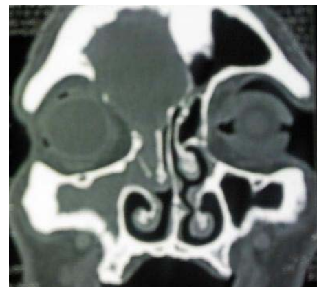
Figure 4. Left frontal opacity in the left frontal sinus that was thought to be a mucocele was seen.

A 41 years old female was admitted to our outpatient clinic with a resistant headache localised on the left supraorbital region. She had no history of trauma or surgery. A nasoendoscopic examination found a mucopurulent secretion in the left nasal cavity. The paranasal sinus CT proved a left frontal opacity that was thought to be a mucocele (Figure 4). The patient underwent frontal sinus surgery with osteoplastic flap and frontal obliteration with fat. The procedure was accomplished successfully without complications. Nearly one year since the procedure, the patient is without recurrence or complication.