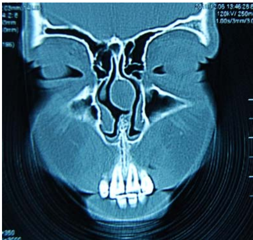
Figure 5. The midline mass localised in the nasal septum.

A 13 years old boy was admitted to our clinic with a one-year history of bilateral nasal obstruction, especially on the left side. He had no smell disorder and denied any visual symptoms. He had no history of major maxillofacial trauma or nasal surgery. On his nasoendoscopic examination, bilateral septal swelling that was more prominent on the left side and minimal adenoid hypertrophy was detected. A CT revealed a large midline septal mass without intracranial extension (Figure 5). The patient underwent endoscopic drainage and total excision of the septal mucocele and endoscopic mini-septoplasty under general anaesthesia. There were no remnants of cartilage or bony septum identified within the septal mucocele. The diagnosis of a mucocele was confirmed histologically. He was symptom free over the next 10 months and there were no evidence of recurrence.